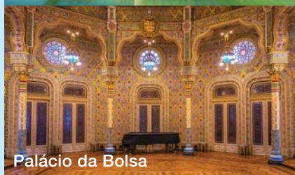
Palácio da Bolsa

6 days from £1,130 Departing 3rd May 2020