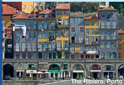
The Ribeira, Porto

Any air holidays and flights in this brochure are ATOL protected by the Civil Aviation Authority. Tailored Travel's ATOL number is 5605